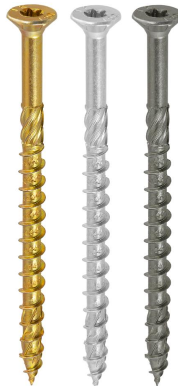
Zn - yellow Zn - blue* SQ ceramic* *item on request and to order